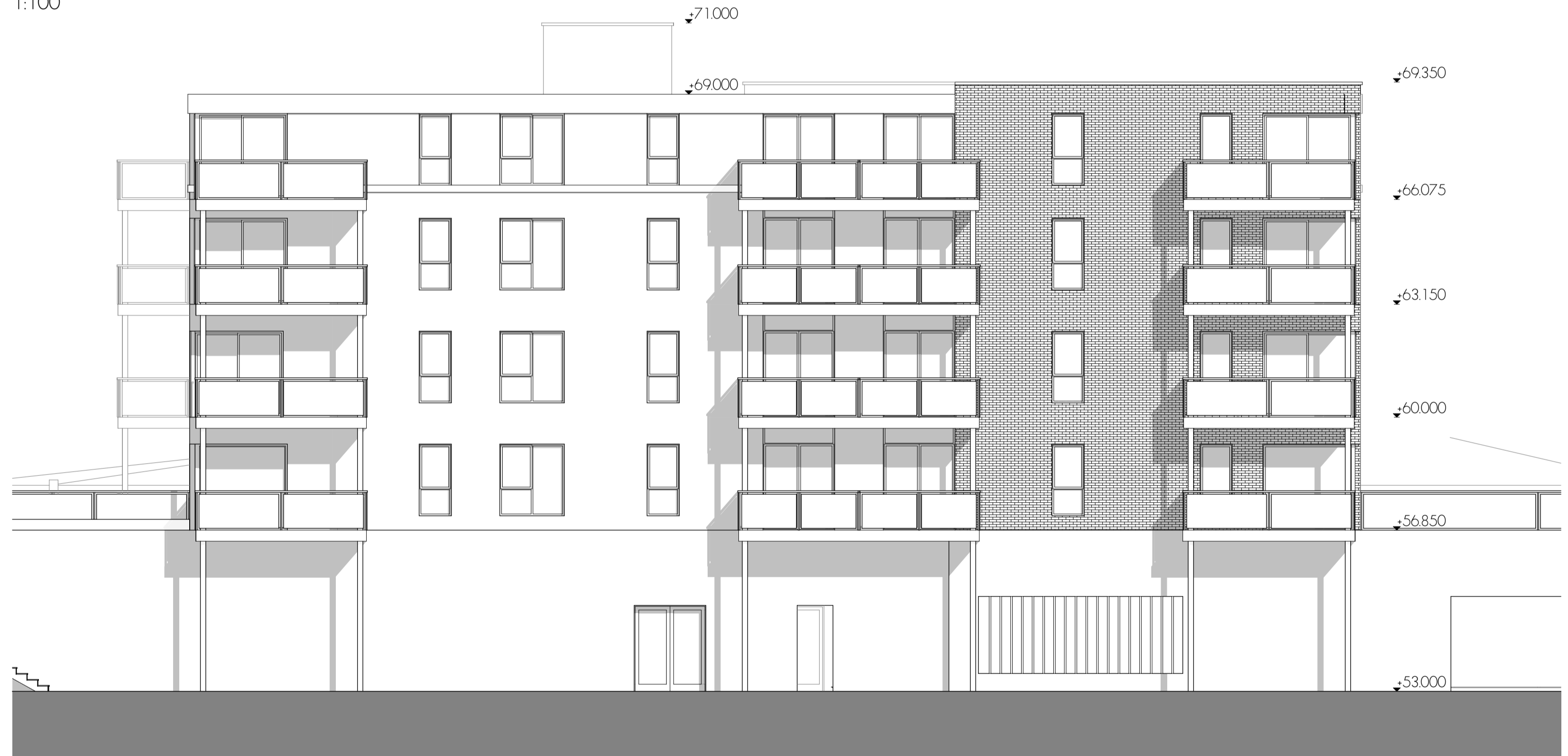
REAR ELEVATION (SOUTH) - BLOCK C 1:100