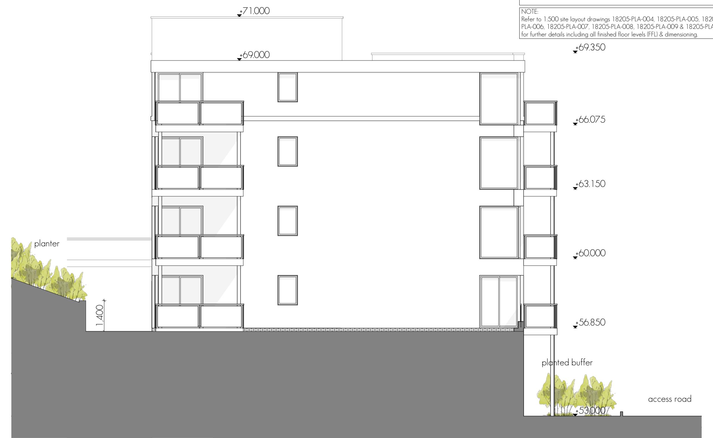
SIDE ELEVATION (WEST) BLOCK C 1:100