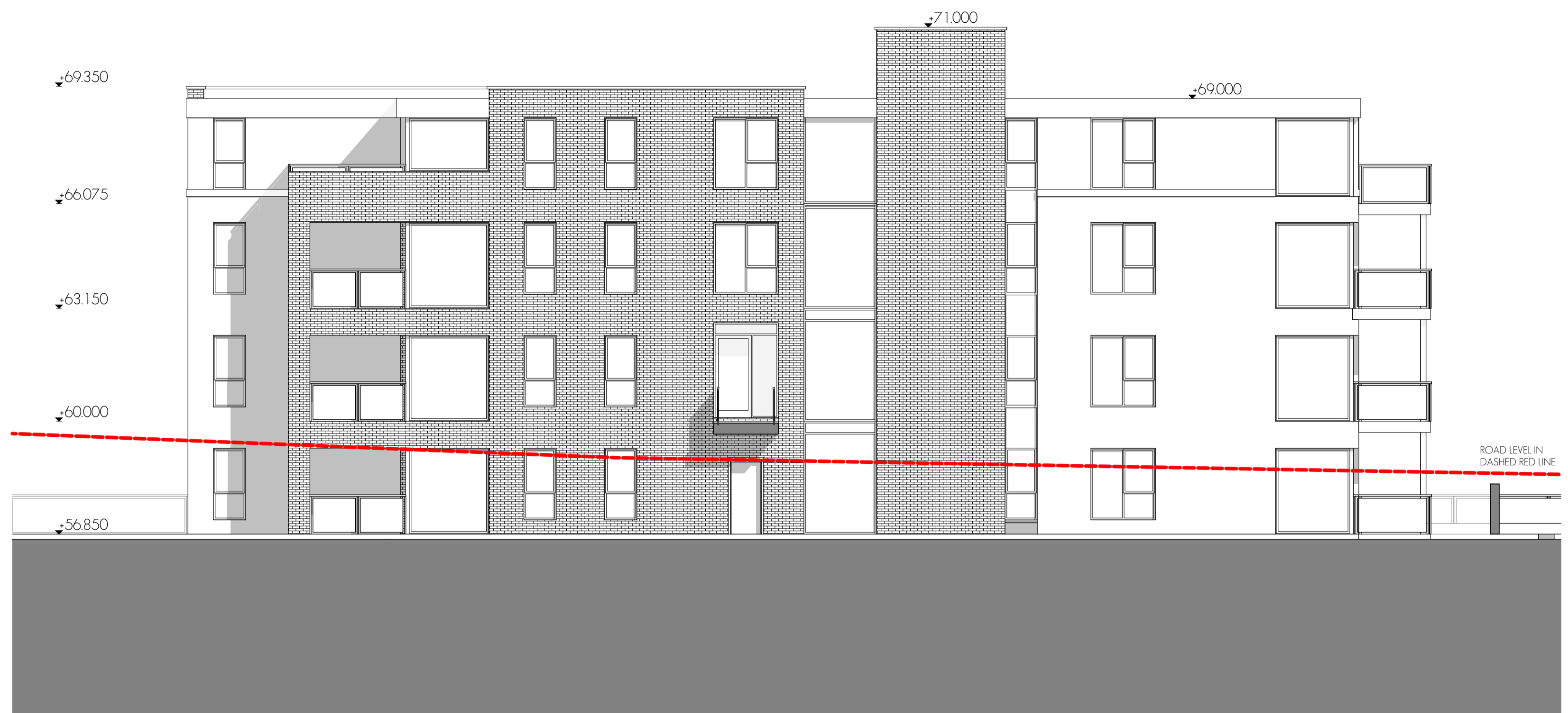
FRONT ELEVATION (NORTH) - BLOCK C 1:100

THIS DRAWING IS FOR PLANNING PERMISSION PURPOSES ONLY. FURTHER DRAWINGS AND STUDIES WILL BE REQUIRED FOR CONSTRUCTION AND TO ENSURE COMPLIANCE WITH RELEVANT BUILDING REGULATIONS AND STANDARDS. NOTE: Refer to 1:500 site layout drawings 18205-PLA-004, 18205-PLA-005, 18205-PLA-006, 18205-PLA-007, 18205-PLA-008, 18205-PLA-009 & 18205-PLA-010 for further details including all finished floor levels (FFL) & dimensioning.